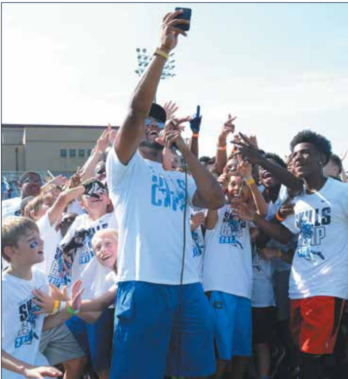
Golden Tate takes a selfie with all the campers at the second annual Golden Tate Skills Camp, held Saturday, June 3, at JPII. Tate returned to his alma mater for the camp and the Golden Tate Scholars Dinner on Friday, June 2.