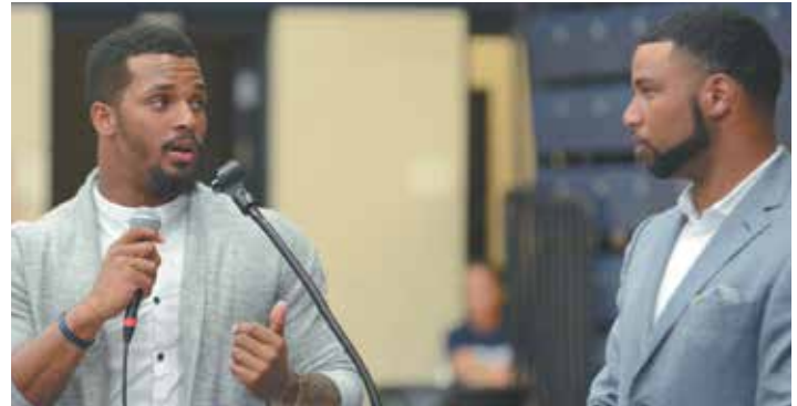
Ameer Abdullah, left, and Golden Tate answer questions during the second annual Golden Tate Scholars Dinner on Friday, June 2. Ameer was the guest speaker at the event. He and Golden are teammates on the Detroit Lions in the National Football League.

“If you believe in yourself ... good things will happen,” Ameer told the crowd at the dinner, which included JPII’s football, dance and cheer teams. Going into his senior year of high school and considered small in stature, he had only one scholarship offer, he said. Rather than be discouraged, his father urged him to keep driving to reach his dreams. “All you can do is maximize what you have,” Ameer said. He ended up signing with the University of Nebraska and finishing his career as one of the top running backs in the storied program’s long history.